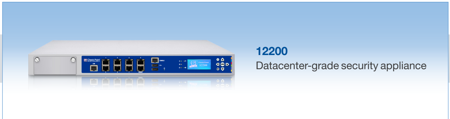
12200 Datacenter-grade security appliance